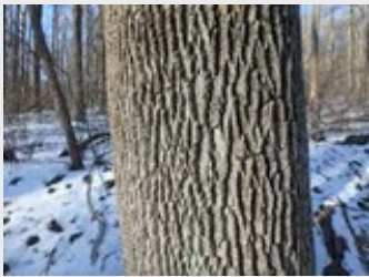
Above and Left: Ash Tree Identification Below: Emerald Ash Borer photos provided