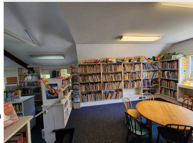
The library's summer reading challenge paper chain wraps around the children section.