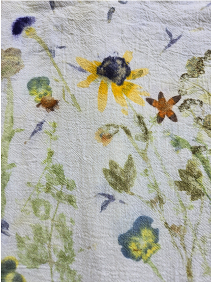
An example of flower pounding, one of many arts and crafts that will be at the library art carnival.